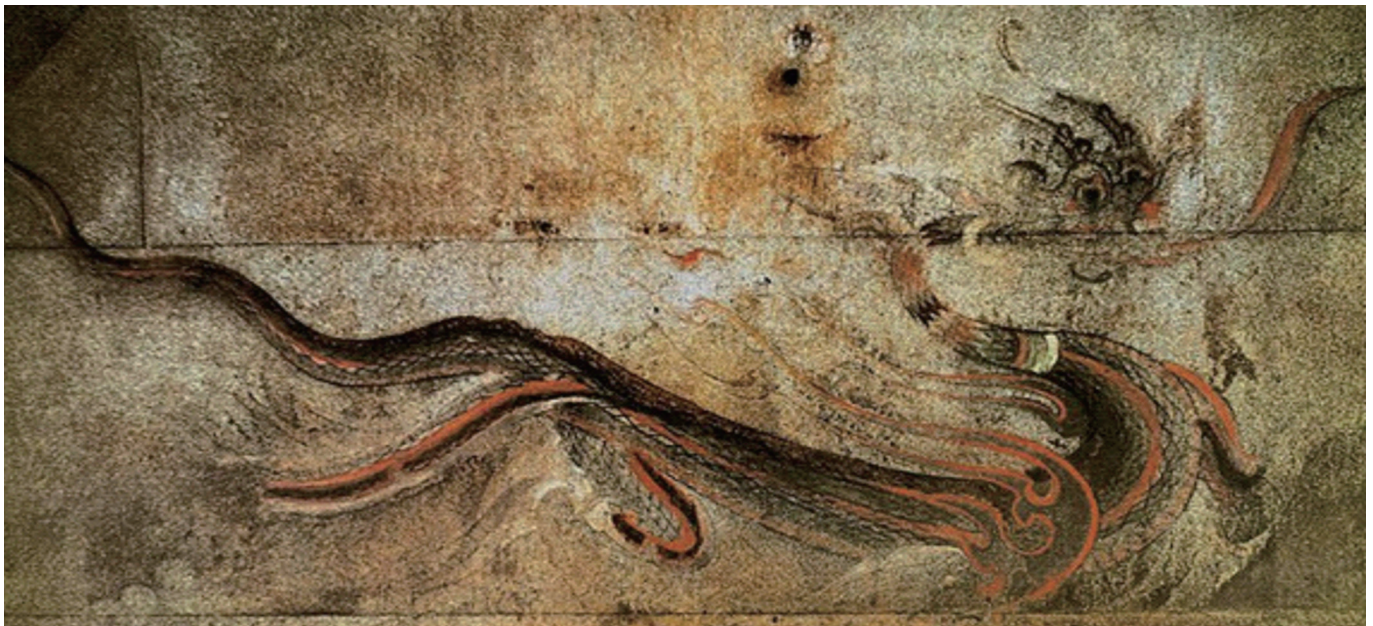
Figure 6. Dragon in the Sashindo tomb painting.

The oriental dragon is also used as a metaphor for the hero. For example, people call an extraordinary person “a divine dragon” and describe a war between two countries as a “fight between two dragons.” In the Chinese novel Romance of the Three Kingdoms (14th century), this conception is illustrated. Cao Cao, the ruler of Wei, said to Liu Bei, who was hiding: The dragon can freely change its shape. It hides and comes out. Once the dragon flies, it can go even into the universe and into the water to hide itself (Ku, 2004). Here the ruler is comparing the dragon to a hero who has the power to conceal himself when necessary and fly away. Today Liu Bei is a popular hero in China and Korea as he was a just and generous man who later became emperor, without forgetting his humanity towards other people. At the time of Cao Cao, Liu Bei had to conceal his true powers in deference to that ruler, who was issuing a warning to Liu Bei not to usurp his authority. Chinese rulers were known to have an image of a dragon on their clothes and their throne in order to associate themselves with the dragon’s power and authority.