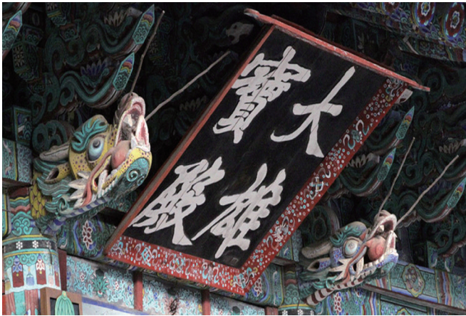
Figure 3. Temple with dragons holding up pillars.