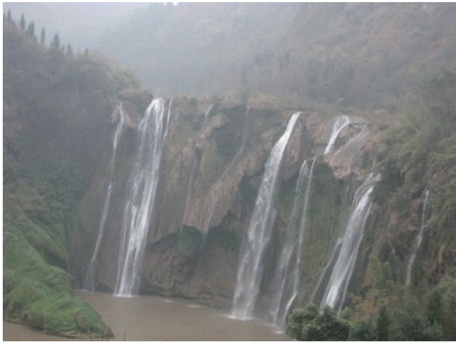
Figure 1. Nine dragons waterfall.

(Cooper, 1978). If a human being accomplishes the difficult task of obtaining the pearl, they would be omnipotent.