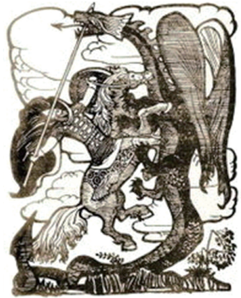
Figure 4. Dobrynya Nikitich slaying Zmey Gorynych, by Ivan Bilibin.

Generally speaking, Oriental mythologies (Chinese, Korean, Japanese) regard dragons as gods, heroes, with qualities of tran-